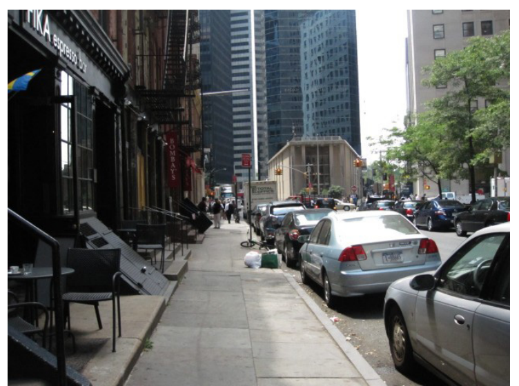
A narrow sidewalk limits the possibility of outdoor seating.

In city's with a short supply of space and a need for more publicly accessible seating, pop-up café's are fast becoming a valued addition to the public realm. If successful, they can also prove the need for permanently expanding city sidewalks.