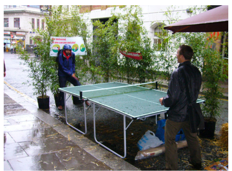
Rain or shine, PARK(ing) Day brings creativity to city streets.

While participating individuals and organizations operate independently, they do follow a set of established guidelines. Newcomers can pick up the PARK(ing) Day Manifesto , which covers the basic principles and includes a how-to implementation guide.