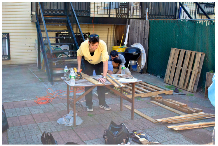
Step 2: Make chairs.