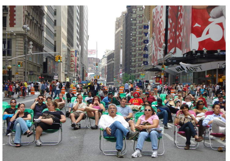
Phase 1 of the new Times Square simply added lawnchairs.

By taking the experimental, "lighter, faster, cheaper," approach, the City and public-at-large are able to test the performance of each new plaza without using up scarce public resources. If successful, the intervention can then transition into a more permanent design and construction phase, as is happening currently in several of New York City's new plazas and sustainable street "pilot" projects.