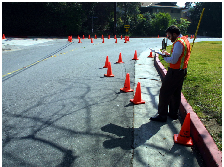
Temporary experiments can test physical improvements prior to implementation.

If included as part of a public charrette process, some examples of tactical urbanism may more quickly build trust amongst disparate interest groups and community leaders. Indeed, if the public is able to physically participate in the improvement of the city, no matter how small the effort, there is an increased likelihood of gaining public support for larger scale change later. Additionally, involving the public in the physical testing of ideas can yield unique insights into the expectations of future users and the types of design features for which they yearn; truly participatory planning should go beyond drawing on flip charts and maps