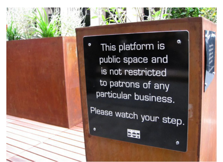
New York City now sanctions what used to be done by advocates.