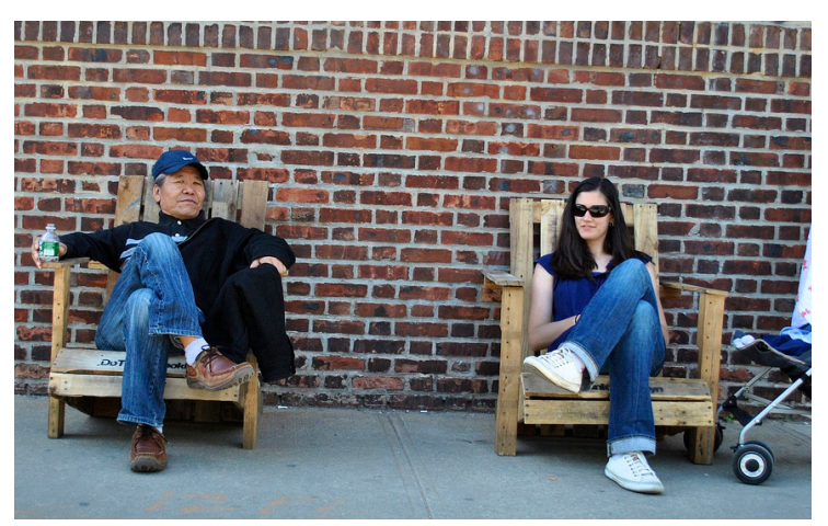
Step 3: Place chairs where needed.