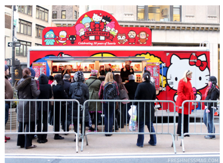
A Pop-Up Shop