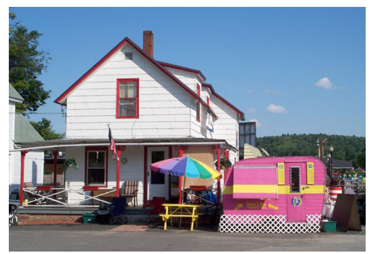
Food carts offer low start-up costs for any entrepreuner.