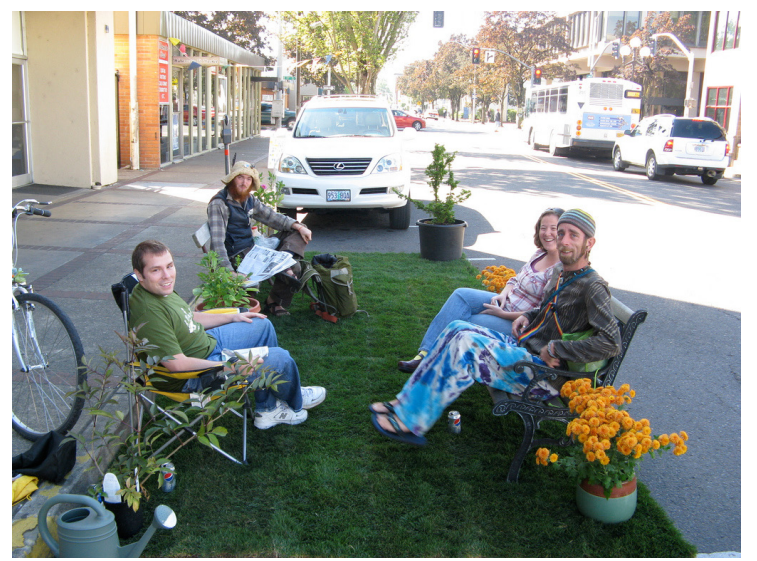
A simple PARK(ing) Day installation.