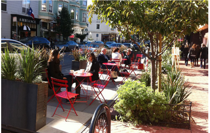
San Francisco's Pavement to Parks.