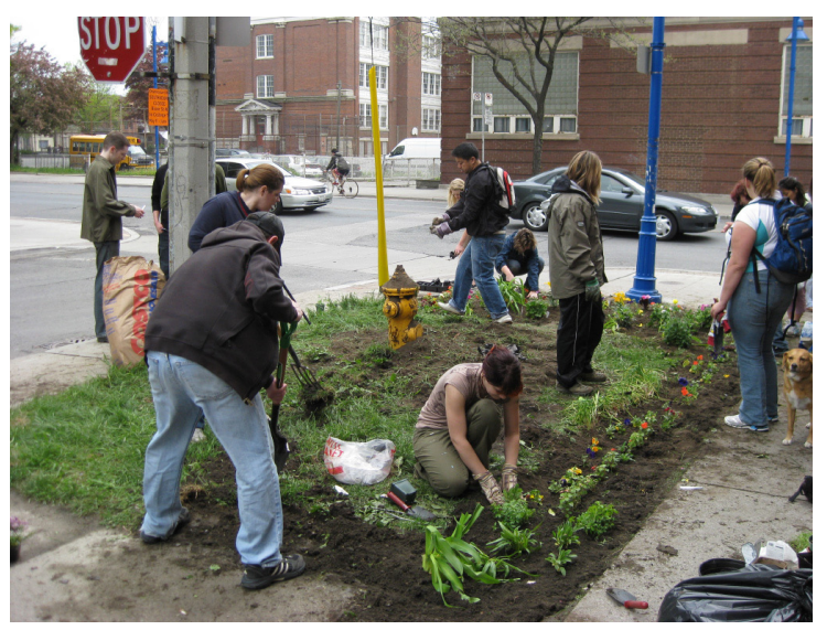
Green Guerillas at work.