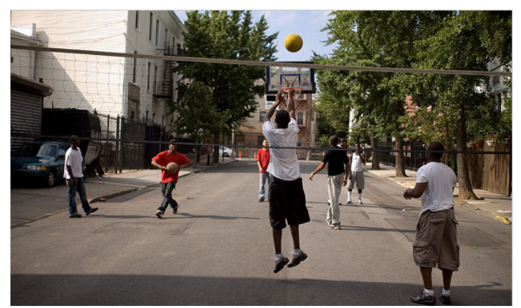
Play streets provide playgrounds where they don't currently exist.