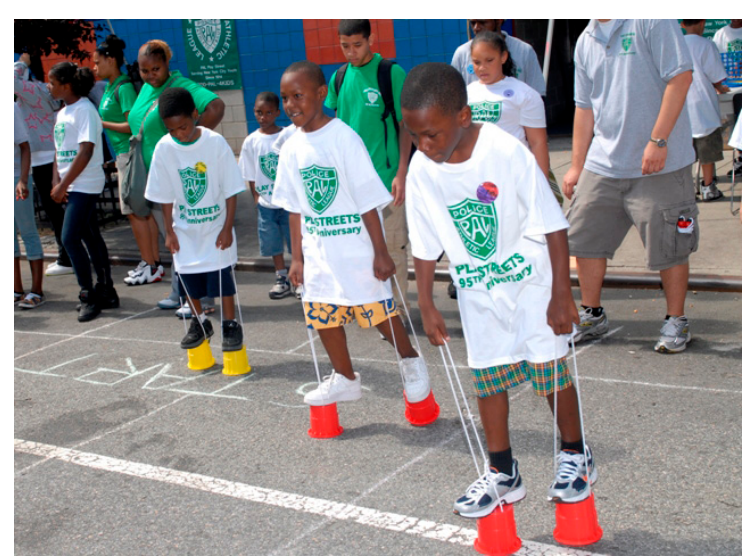
Play streets give kids space to move.

In New York City, a 'play street' is made possible when 51% of the residents living on a one-way residential block sign a petition and offer it to their local police and transportation officials, who then send it to the local community board for review. Once the community board approves the idea, the initiative can take shape and the city provides youth workers to supervise the program. Approximately 75% of these initiatives are organized by the New York City Police Athletic League.