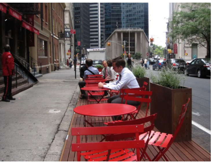
Trading parking space for outdoor seating that can be used by restaurant patrons or passersby is a win-win.