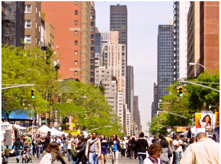
One of New York City's many street fairs.

OVERVIEW: Street Fairs are a traditional aspect of community life in many American cities. Typically organized as annual events, these initiatives bring together a wide variety of organizations and institutions from the local community and give them the opportunity to showcase their products and services. It is the type of event where people become familiar with each others skills and learn what their community has to offer. Often, street fairs take place within a community's main street, or at larger sites, such as the village green or a centrally located plaza. This can raise the visibility of the city's premier public space and offer entertainment to citizens of all ages: many well-programmed street fairs feature musical performances, art exhibitions, interactive entertainment, and local food vendors. Street fairs can also provide the opportunity for communities to organize political support for local improvement initiatives.