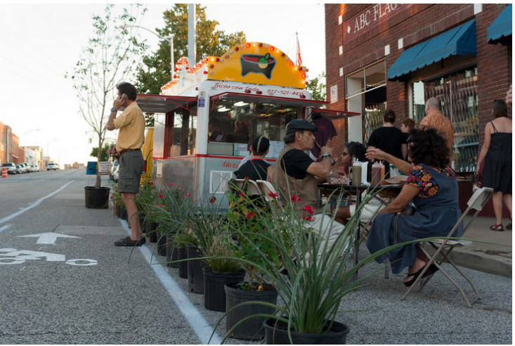
Fort Worth, TX Build a Better Block.

in Forth Worth, TX, Oyster Bay, NY, and Memphis, TN where 15,000 participants helped reinvigorate a stretch of Broad Avenue.