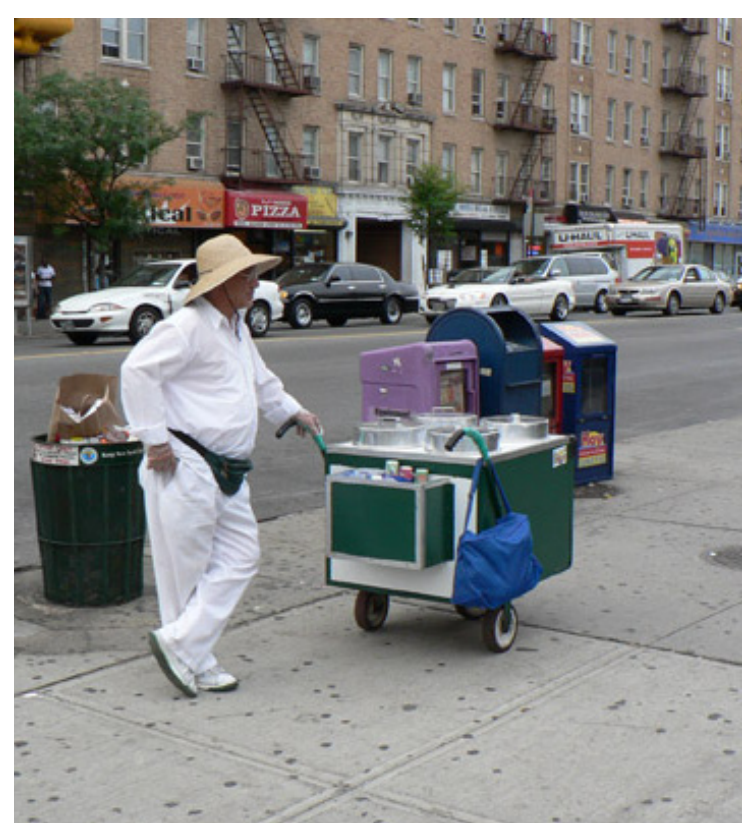
A New York City Street Vendor

According to Shinohara, vendors play a key role in animating the various spaces of a city. This "Custom Bike Urbanism [...]" suggests a possibility of constructing urban spaces that are individualist and dispersed, yet able to accommodate a multitude of dynamic forms. With the inherent characteristics of mobility and ephemerality, it brings vibrancy to redundant urban space and enhances the function of the existing city."