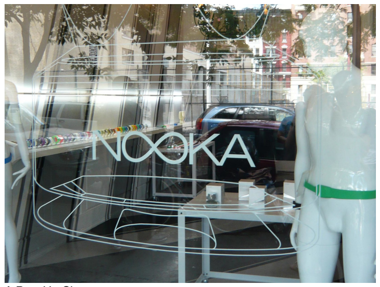
A Pop-Up Shop