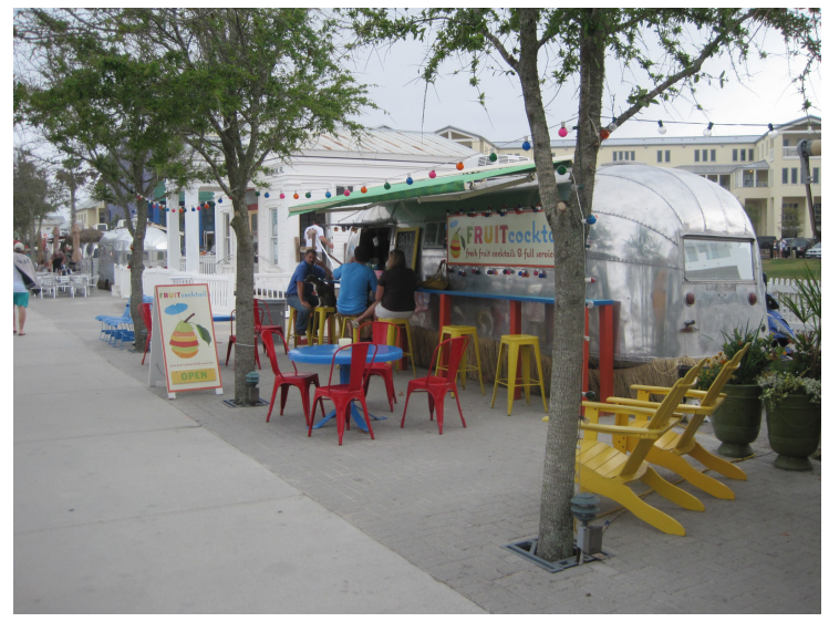
Food carts line Seaside, FL's central square.