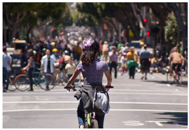
San Francisco's Sunday Streets