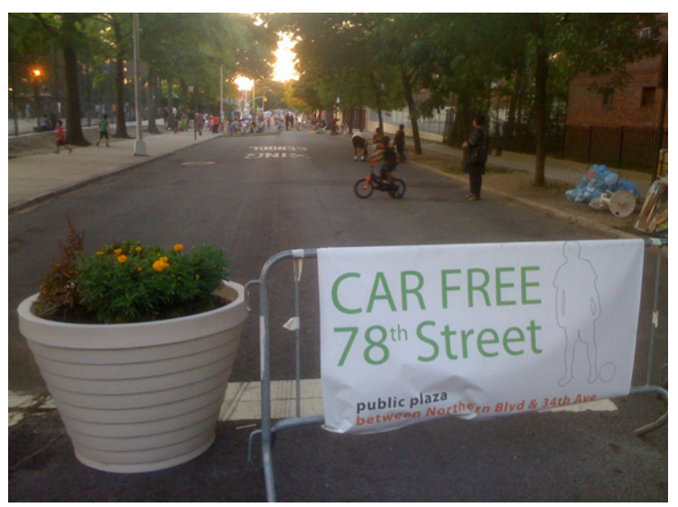
Car free space provides carefree play space.