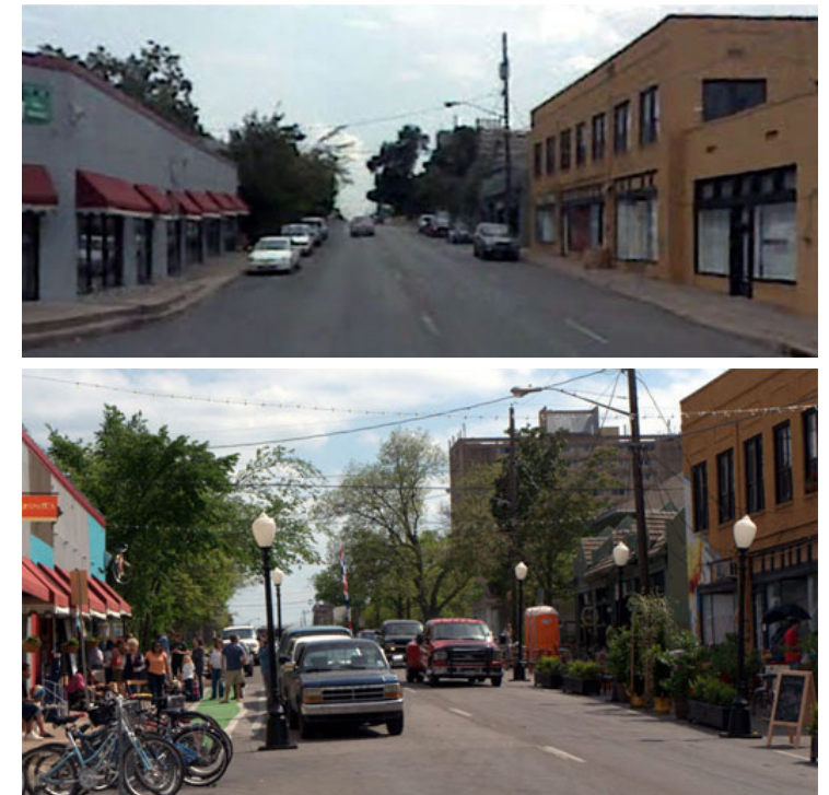
Before and after: Dallas Build a Better Block

Finally, the Better Block Project continues to captured the attention of urbanists and advocates across the country. Indeed, similar efforts have now taken place