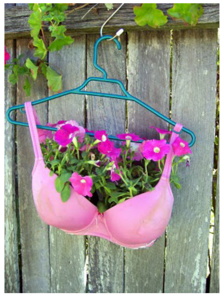
Guerilla Gardening offers an outlet for creative energy.

Guerilla gardening is an exellent tactic for instantly improve an urban neighborhood. Often times, gardens are cared for years after they were first created illegally. Indeed, the first garden started in vacant New York City lot by the Green Guerilla's became so loved that it is now maintained by volunteers and the New York City Parks Department. This is how tactical urbanism is intended to work.