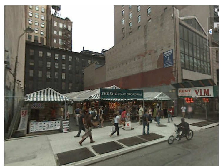
Pop-up tent-based retail helps activate this vacant lot.

More than just marketing ploys for large retail corporations, pop-up stores genuinely bring vitality and help businesses transition to permanent spaces.