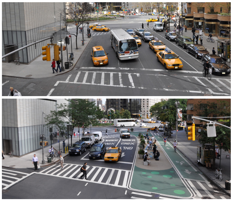
NYC's Greenlight for Broadway provides more space for people.