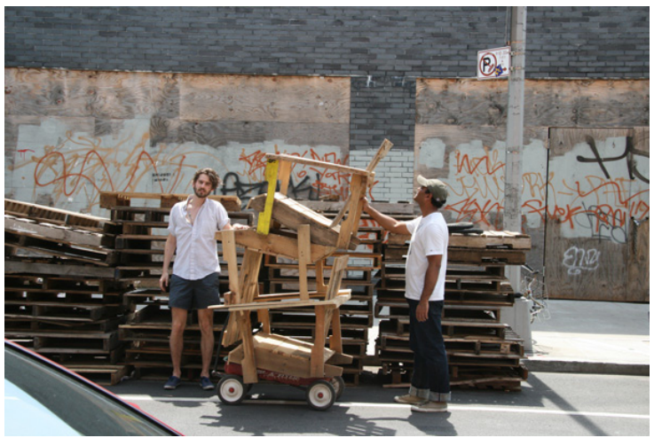
Step 1: Collect used shipping pallets.

Whether to rest, socialize, or to simply watch the world go by, increasing the supply of seating almost always makes a street, and by extension, a neighborhood, more livable.