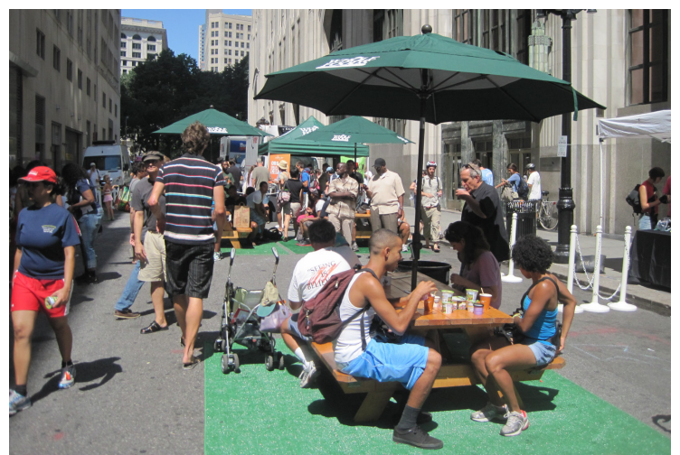
Street fairs help bring communities together in the public realm.